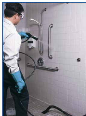
Use high pressure setting to rinse tiled area from top to bottom.

The Model 750 comes complete with 10 standard tools and accessories.