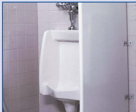
Urinals and toilets