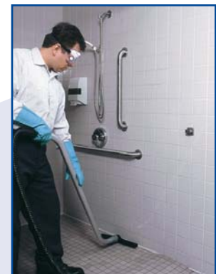
Recover dirty water into the recovery tank with the floor squeegee tool.

The Model 750 All Surface Cleaner: A brilliant way to spend your cleaning money and time.