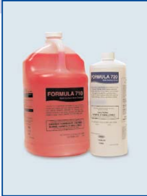
Formula 710 cleaning chemical and 720 rinse agent are designed for use on hard tiled surfaces.