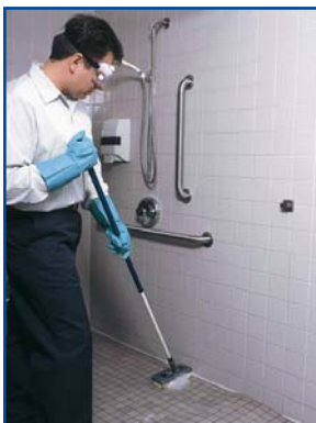
Scrub floors, walls and fixtures to remove scum and soil buildup from surfaces.

Tennant has just the right solution for the number one cleaning challenge: restrooms and other hard surfaces. The Model 750 All Surface Cleaner can clean up to three times faster and more thoroughly than the manual “wipe down” method, which misses corners and hard to reach areas and just spreads the dirt around.