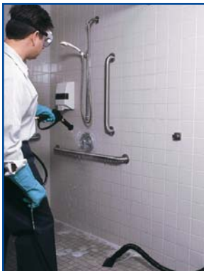
Use the low pressure setting to apply the Formula 710 Multi-Surface Cleaner.