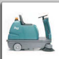
Standard side brush