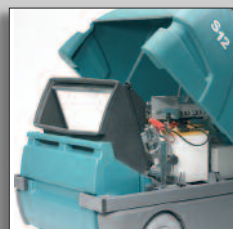
Easy filter change